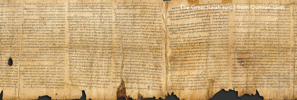
The Great Isaiah scroll from Qumran caves

to look at the news channels to see that there is sin in the world – scandals, perversions and brutality are all around us. The Bible makes clear, however, that sin has affected all our lives and tells us that ‘through one man sin entered into the world and death through sin, and thus death spread to all men because all sinned’, Romans 5. 12. None of us can live up to God’s standard of perfection and we are separated from Him because of that. This means that ultimately we cannot enter Heaven to be with God and will be punished eternally for our own sin in Hell. God loves us and doesn’t want this for us so has written the Bible to tell us how we can be saved from this punishment and brought to Him.