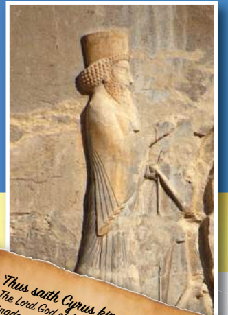
Relief of Artaxerxes II on his tomb at Persepolis, Iran.